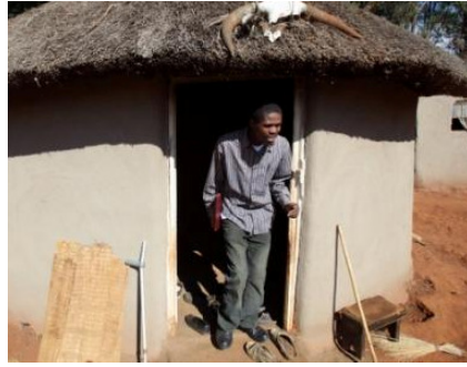
A student visiting a rural home during second-year students' outreach trip to Bergville.

This is part of an overall strategy of strengthening the connection between ESSA and local churches. Not only does this allow more individuals and churches to benefit from ESSA's services, it builds a network of local prayer and financial partners with ESSA's ministry. Please contact the ESSA office if your church is interested in hosting a team.